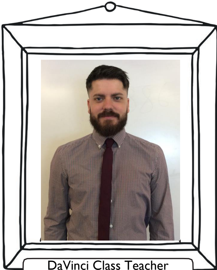
DaVinci Class Teacher Key Stage 2 Leader