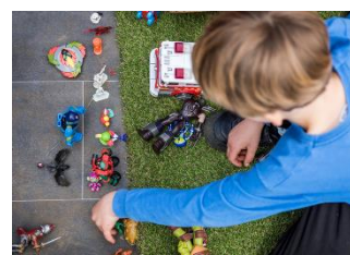
Small World Imaginary Play

Further information to follow in the coming weeks so watch this space!!