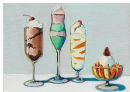
'Sweet treats and cakes' For children aged 8-13

Saturday mornings 9.30-11.30am 2 workshops 4 Feb + 11 Feb 2023 £22 per workshop